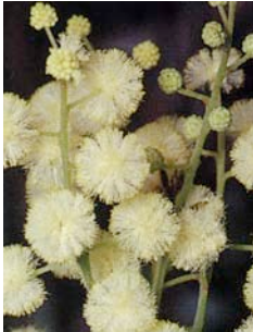
Acacia implexa Lightwood 8m x 4m Heath woodland, prefers full sun and grows in all soils