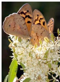
Bursaria spinosa Sweet Bursaria 8m x 3m Heath/Coastal Woodland Grows in most soils and aspects