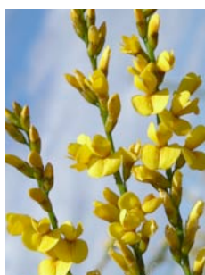
Viminaria juncea Golden Spray 4m x 2m Heath Woodland Prefers slightly moister soils