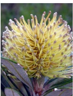
Banksia marginata Silver Banksia 5m x 3m Heath woodlands Prefers well drained soils and very adaptable