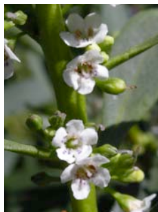
Myoporum insulare Common Boobiella 5m x 3m Coast Woodlands Grows well in most soils and is very adaptable