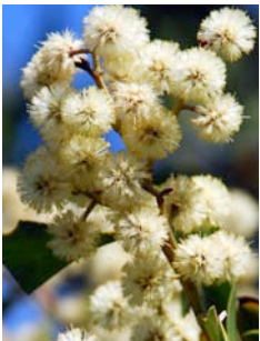
Acacia melanoxylon Blackwood 8m x 4m Heath woodland, can tolerate wet soils, but will grow anywhere.