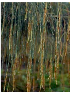
Allocasuarina verticillata Drooping She-oak 8m x 3m Coastal woodlands Prefers well drained soil tolerates dry conditions