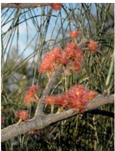
Allocasuarina littoralis Black She-oak 8m x 3m Heath woodland, prefers dry soil