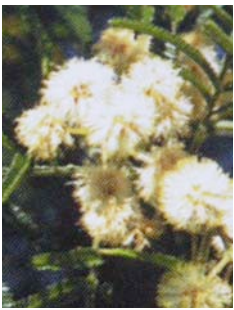
Acacia mearnsii Black Wattle 7m x 4m Heathland, woodland, prefers well drained conditions