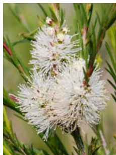
Melaleuca ericifolia Swamp Paperbark 5m x 2m Heath/coast woodlands Prefers wet soils but will grow in most conditions